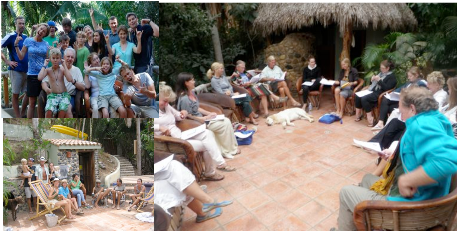
Palapa Tigre Gathering Place Great for Workshops!

The Tailwind lodge retreat center has a max capacity for 16 people, though we recommend 14 people for retreats. The lodge consists of 6 different units that are separated for privacy. We recommend that retreat leaders stay in the Palapa Tigre, which is the central place on the property. Groups generally gather for meals and workshops at the deck of the Palapa Tigre. The pool next to the Palapa Tigre is also a good central gathering space.